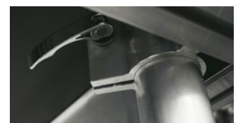
Plug IN leg system

Variability, Loading capability Quick and Easy Installation