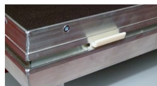
Quick integrated PVC connector