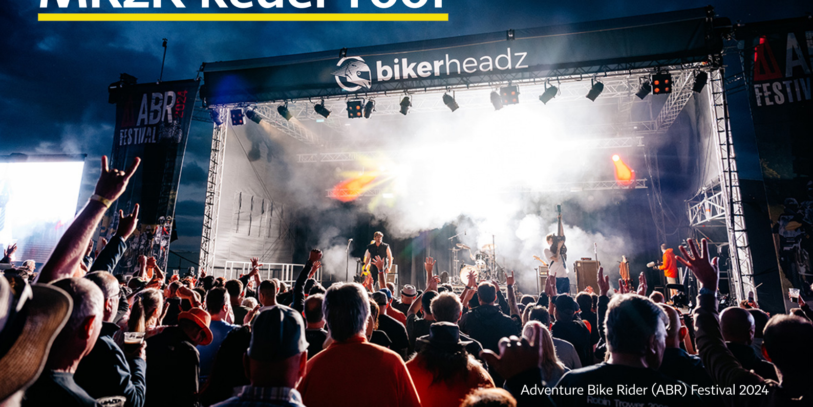
Adventure Bike Rider (ABR) Festival 2024